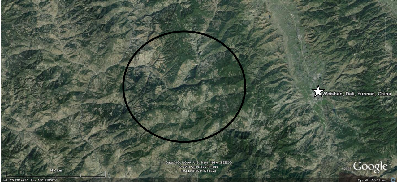
Figure 2. The general location of the Concession (shown as the black circle) on an image generated from Google Earth - in relationship to the town of Weishan (shown as the white star), Weishan is situated south of Dali City.