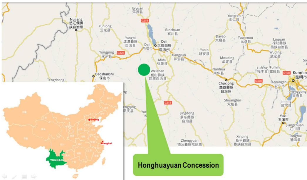
Figure 1. General location map – with insert showing Yunnan Province in the PR China.

The Honghuayuan Concession is southwest of Dali City in Yunnan Province, to the west of the town of Weishan. The Concession occupies 48.15 square kilometres in area and is prospective for copper, gold, zinc, lead, iron and antimony. At present, electromagnetic soundings are being recorded over the most prospective areas within the Concession, this work is being funded by the Concession holder. Figure 1 shows the position of the Concession within the background of the Yunnan Province shown as in insert in relation to the whole of China. The Concession area is in a mountainous region of Yunnan with access to some areas restricted to minor gravel roads, although access is quite reasonable.